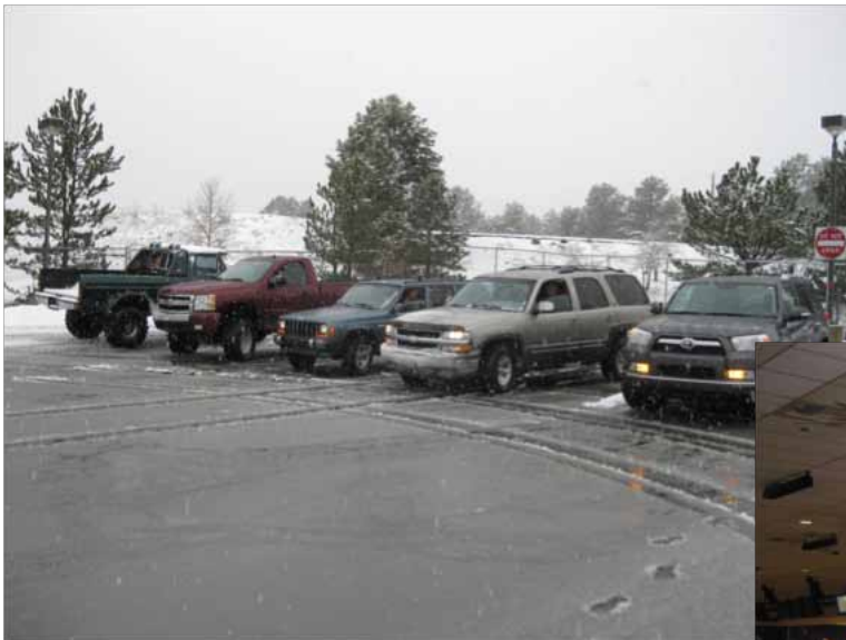
The brave ones leave snowy Flagstaff

Shake Rattle and Bowl Cliff Castle Casino 19 February, 2011 Sue Obrzut