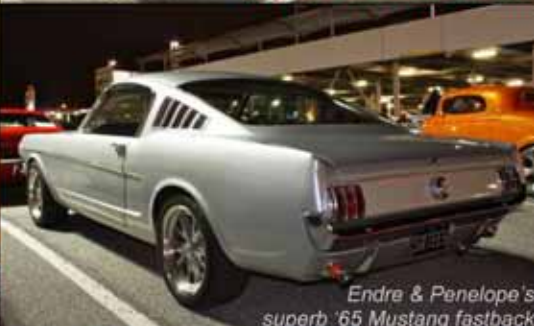
Endre & Penelope's superb '65 Mustang fastback