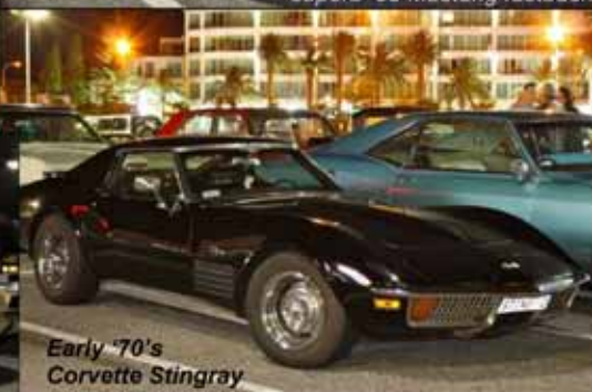
Early '70's Corvette Stingray