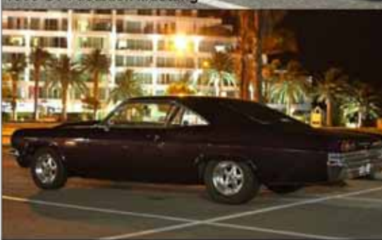
Above: Steve's big block 1965 Chevy SS Sport Coupe.