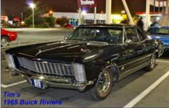
Tim's 1965 Buick Riviera