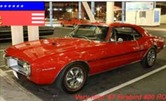
Very nice '67 Firebird 400 HO