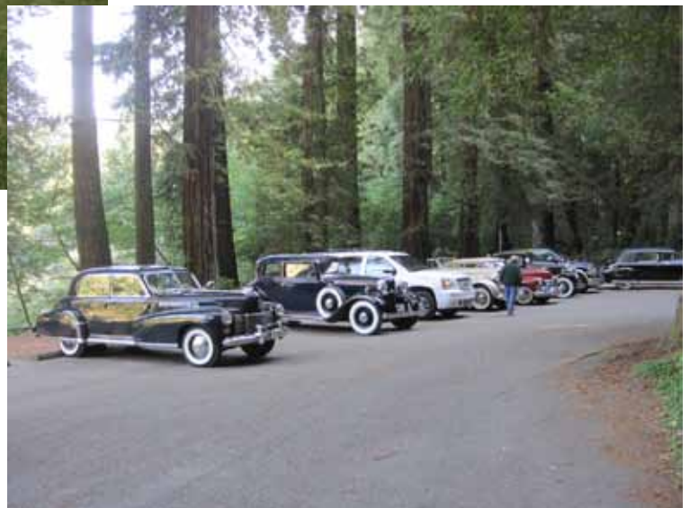
We dipped into California to see the redwoods at Jedediah Smith State Park. That's my Cadillac on the left