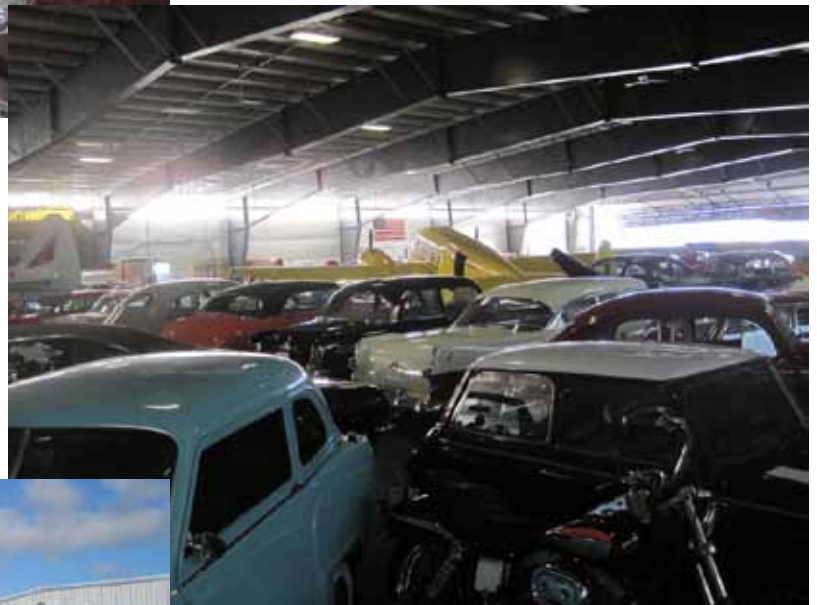
The Western Antique Aeroplane and Automobile Museum is located in Hood River, OR. There are 3 large hangars full of classic cars of all kinds from the 20's through the 50's, with airplanes from the same period. This is a portion of the main car collection.