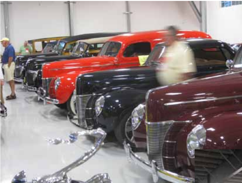
This is a private collection outside Portland. He has about 20 cars, mostly from the 20's to 40's, and leaning toward Fords. He does his own restoration.