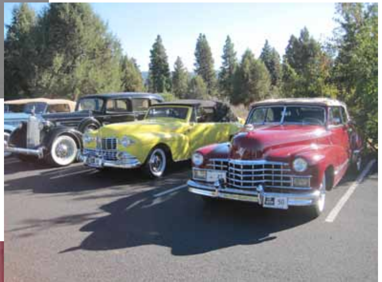
These show the variety of cars on the trip: a 1935 Packard Limousine, a 1946 Lincoln Continental Cabriolet, a 1947 Cadillac 62 Convertible Coupe, and a 1933 Rolls Royce Phantom II Convertible Sedan