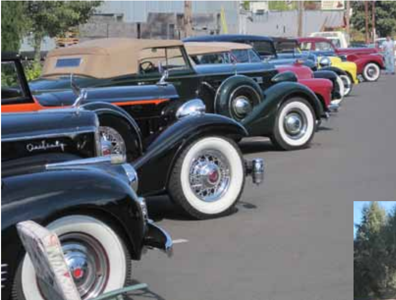
Another line-up of cars in wine country at Carlton, OR.

We were accompanied by 45 other classic cars, ranging in age from 1928 to 1947 Bear