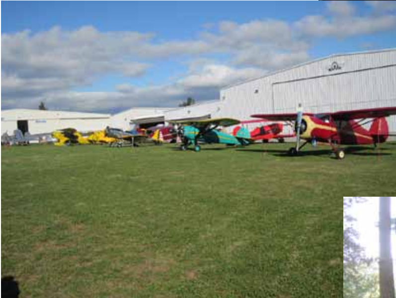
This was a fly-in weekend. All the planes here actually flew in to the Museum that week. There were about 2 dozen aircraft, none later than the 50's, that did the same. Several vintage planes left while we were there.