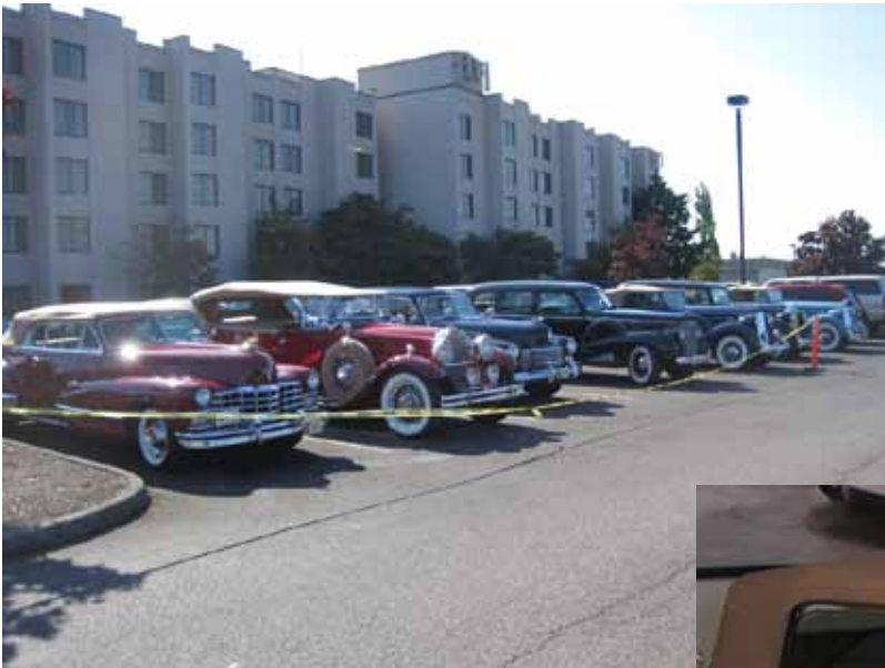
A few of the cars at our first hotel in Portland. My Cadillac is 3rd from the left.

Memory Lane Motors in Portland is actually a dealer – he has about 20 older cars from the 30's to the 60's available at fairly reasonable prices.